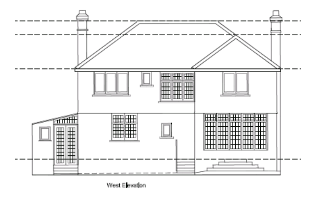
Fig 3: Existing and proposed side elevations