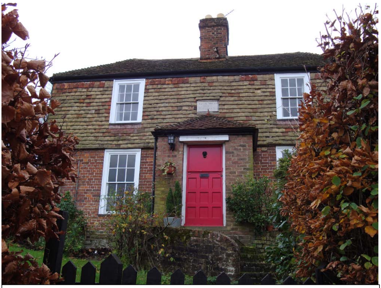
Sandy Mount as viewed through its front hedge on Ware Street.