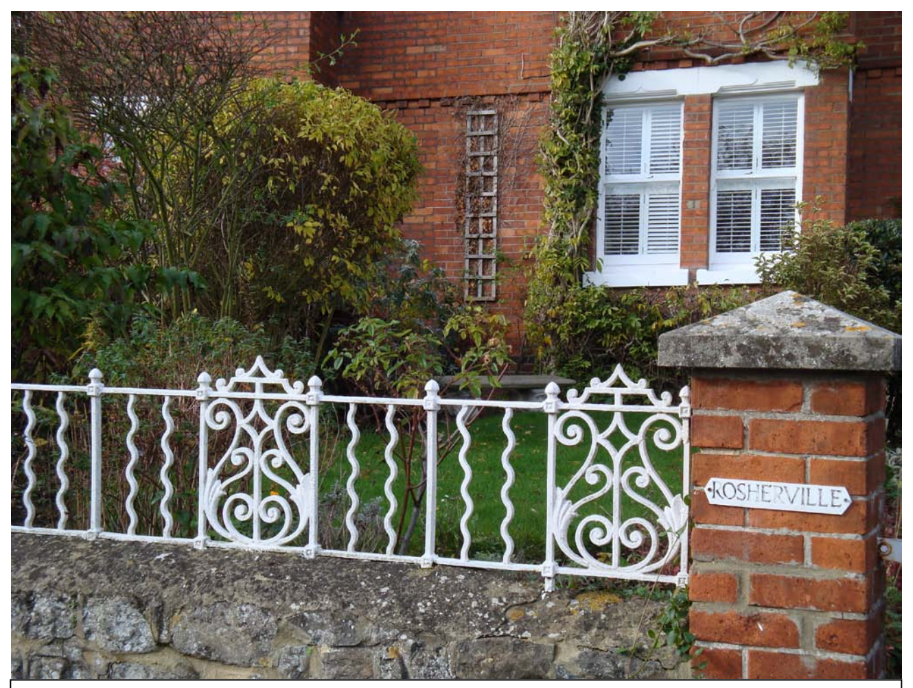
Boundary treatments can make important contributions to the character of a conservation area, as at Rosherville and Cliftonville, which retains its characterful ragstone, stock brick, and iron detailing.

their original matching cast iron gates. Other particularly important boundary features include the tall ragstone and brick walls at Bearsted House and the series of ragstone walls which define the edges of Yeoman Lane as it approaches and enters the Conservation Area.