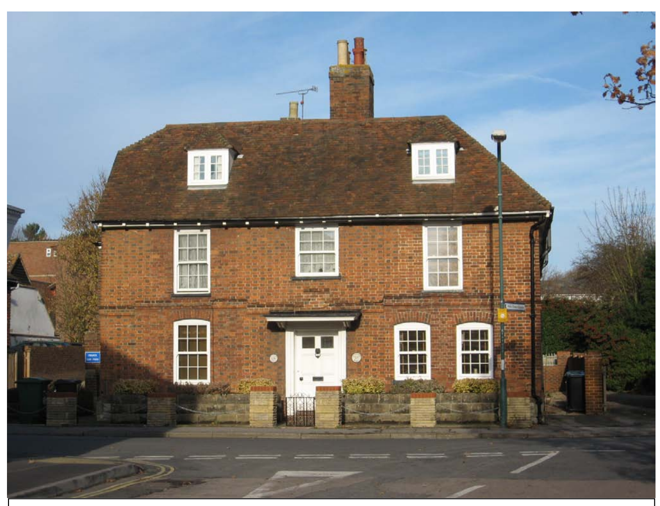
Crisfield House and Cottages, located on the prominent junction of The Green and The Street.