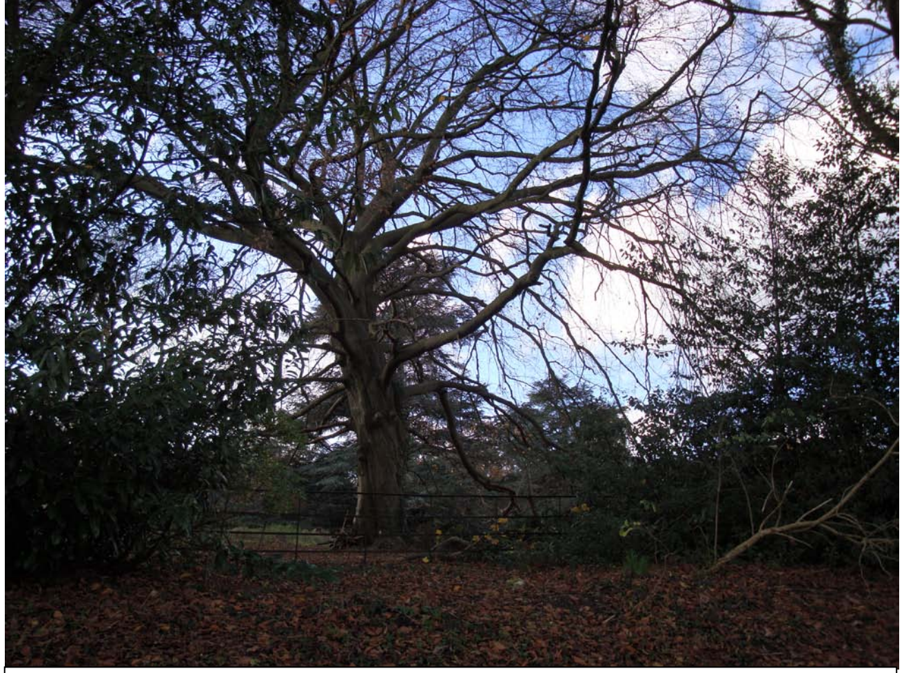
The grounds at Snowfield, as viewed from within Bearsted Conservation Area.

The analysis is split into three sections reflecting the different character areas identified in surveying the Conservation Area – Snowfield, its grounds and immediate surroundings, the Green itself and those buildings which border it, and the narrow eastern section of The Street.