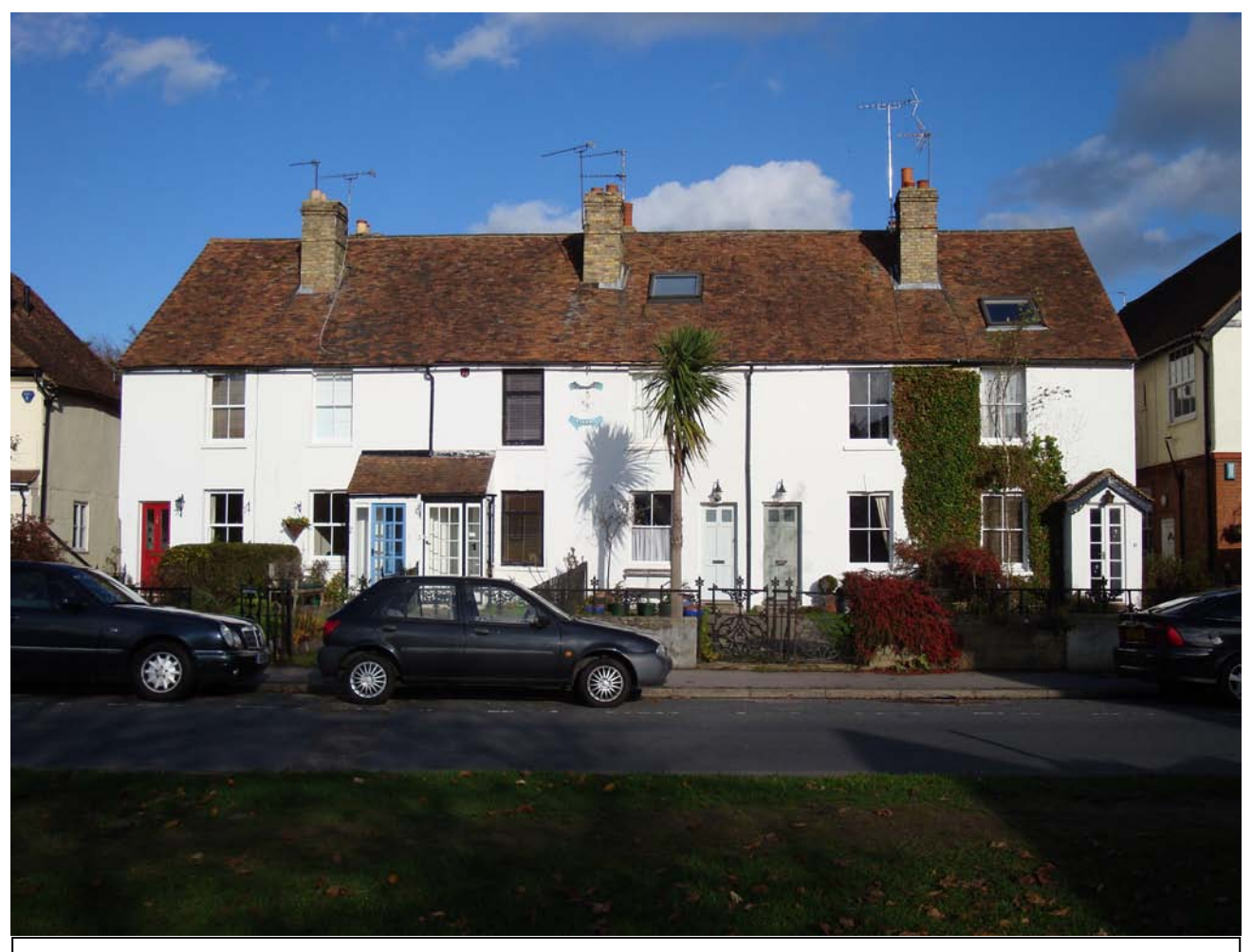
Invicta Villas, one of the terrace rows located at this end of the Conservation Area.