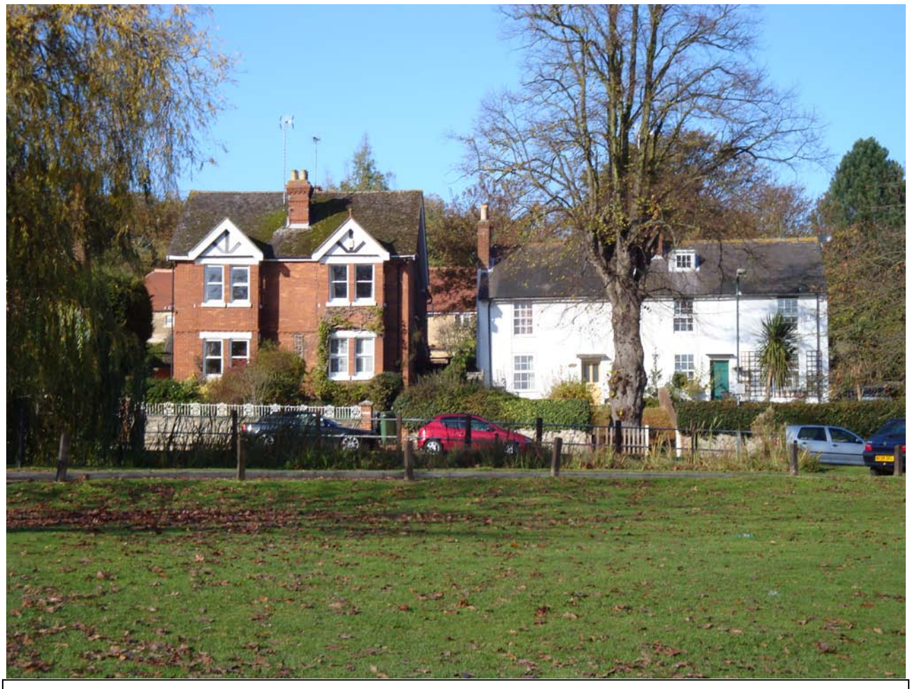
Trees help establish the character of the Bearsted Conservation Areas.

This is not a comprehensive list, but seeks to identify the most important trees or tree groups. In the eastern part of The Street, trees are a less prominent feature of the villagescape, although the view westwards is terminated by the trees on Hog Hill.