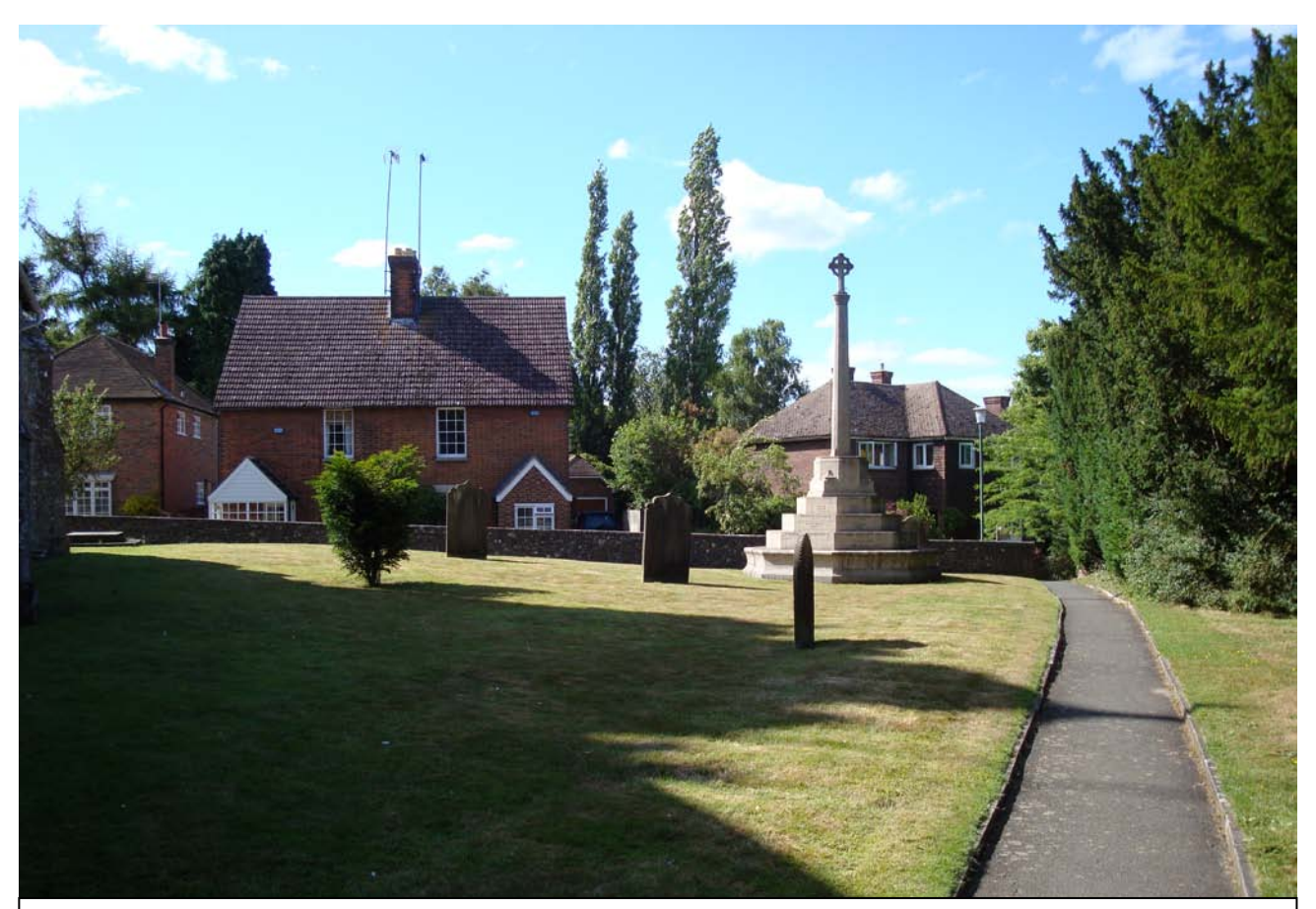
The Grade II listed War Memorial with the backdrop 19<sup>th</sup>- and 20<sup>th</sup>-century residential development viewed from Holy Cross churchyard.

The individual merit of a number of buildings in the Conservation Area has been recognised by Central Government and a total of six buildings or other structures are protected from unauthorised alteration or demolition by being statutorily listed as buildings of special architectural or historic interest. Primary amongst these is the Church of Holy Cross, which is listed Grade I. The war memorial and three table tombs in the churchyard (one of which could not be located at the time of survey) are also listed, as is Mote Hall. Most other buildings in the Conservation Area make some positive contribution to its character and none significantly detract from it.