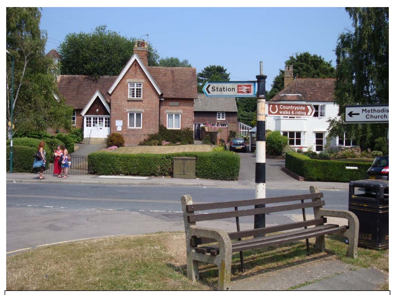
Features which negatively impact the character of the Conservation Area include painted yellow lines, standard highway signs and litter bins, and poorly-maintained street furniture.

There is no historic paving within the Conservation Area – pavements are almost exclusively black tarmac and kerbs are standard concrete ones. Two areas of modern brick pavers exist – behind Smarts Cottages on the rear service access which represents the stub of the blocked track across The Green and on the access to the new development in the grounds of Bearsted House. The use of such materials has no historic precedent within the Conservation Area. The lack of pavements in the narrow section of The Street and at various points around The Green is an important factor in the character of the Conservation Area.