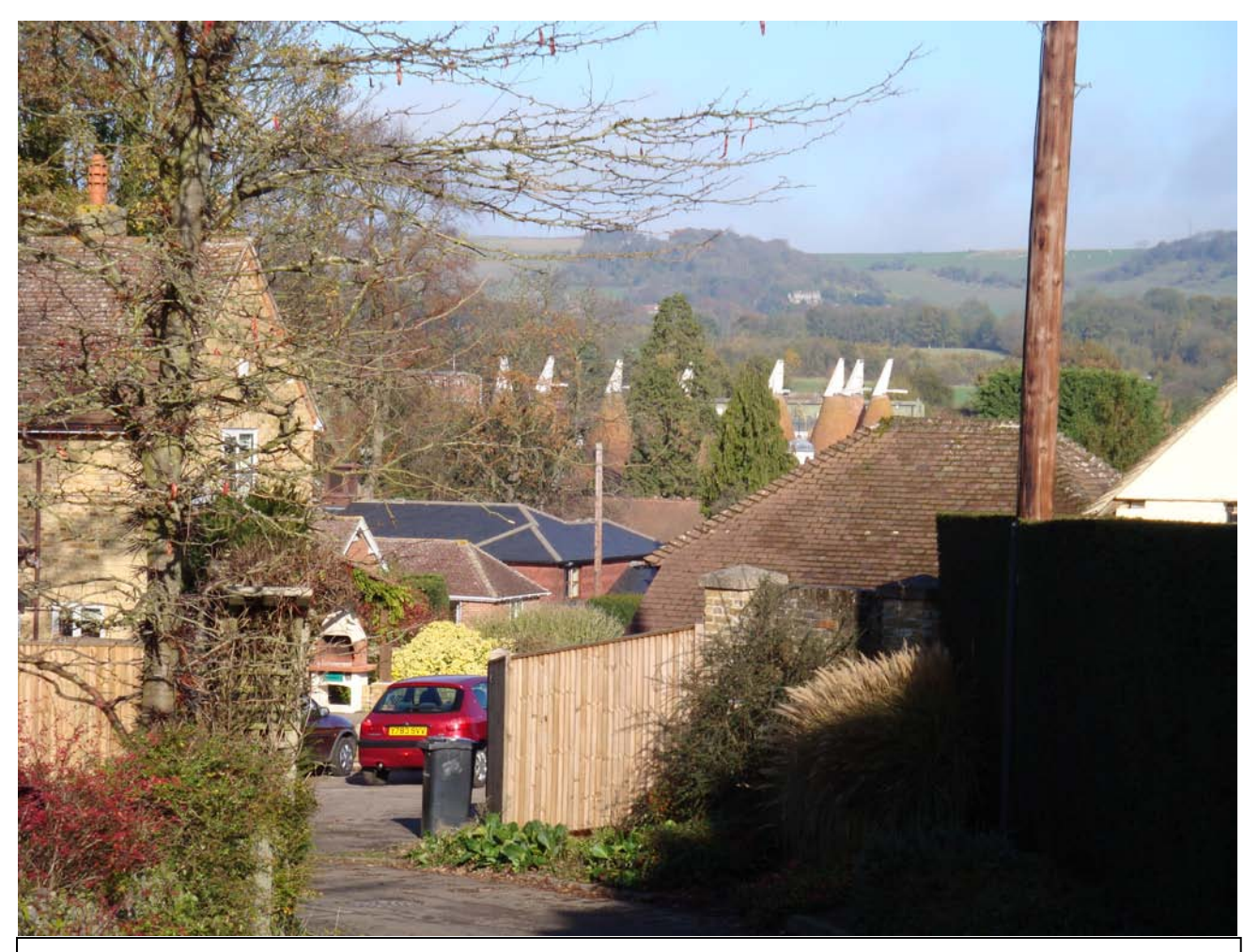
This view from Church Lane provides a visual link between this Conservation Area, Bearsted Conservation Area, and the North Downs.

Coming from Roseacre and Yeoman Lane, the approach is via a narrow footpath initially enclosed between garden boundaries until the car park is reached on the right. It is not until the last minute that the tower of Holy Cross Church comes into view, closing the view through the narrow access between the Mote Hall outbuildings and the hedged boundary of Mote Croft – one of the best views in the Conservation Area. This view also forms the final episode in the approach along Church Lane.