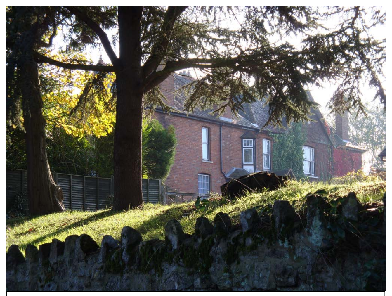
The Mount provides the entrance to Bearsted Holy Cross Conservation Area from Church Lane.

Approaching from The Green the Conservation Area only comes into view when the first bend in Church Lane is rounded. The dominant feature is the ragstone boundary wall of The Mount overhung by trees within its grounds, balanced by the substantial hedge on the other side of the road. The gentle curve of the lane means that the view is closed by trees in the front garden of Danefield; vegetation dominates, and buildings are only glimpsed through trees.