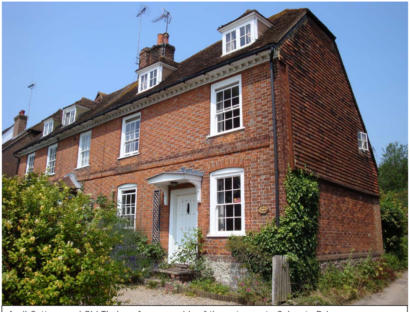
April Cottage and Old Timbers form one side of the entrance to Colegate Drive.