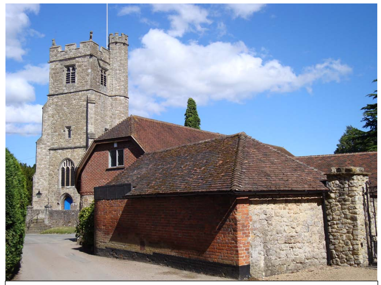
Former service buildings to Mote Hall with Grade I listed Holy Cross Church in the background.