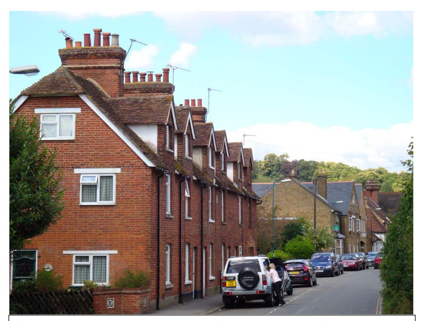
Olivers Row at the eastern entrance to Bearsted Conservation Area establishes a more urbanised character to the area located along The Street.

century, single storey, flat roof extension with iron balcony. First phase of the southwest wing has large, gable end dormers with casement windows. A large brick extension to this wing dates from the 1890s and has large, gable ended cross wings with applied timber detailing (a smaller projecting gable shares this detail). Other features of this wing are large mullioned and transomed windows. A 19th century timber framed well cover commemorating the Diamond Jubilee of Queen Victoria (1897) is located at the street edge.