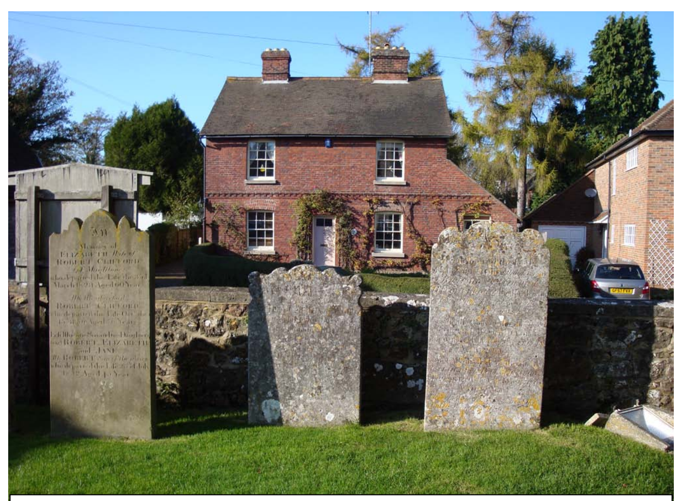
This view of Danefield Cottage indicates that few modifications have been made to the façade of this characterful Edwardian house. It also illustrates the importance of retaining historic features like gravestones in the Conservation Area.