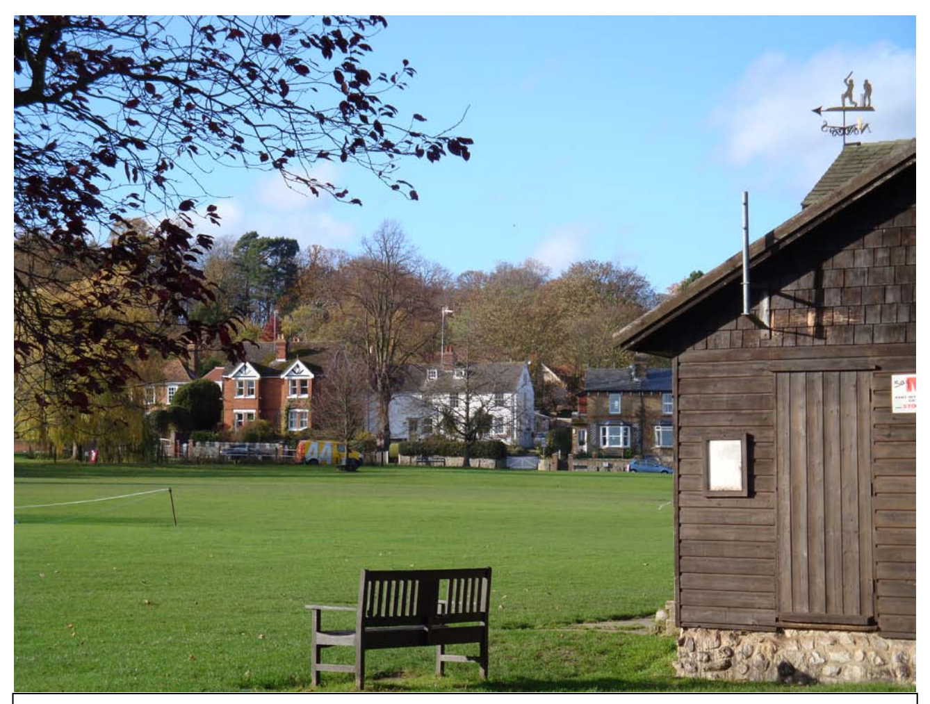
Looking west from the eastern end of The Green, with the Cricket Pavillion on the right