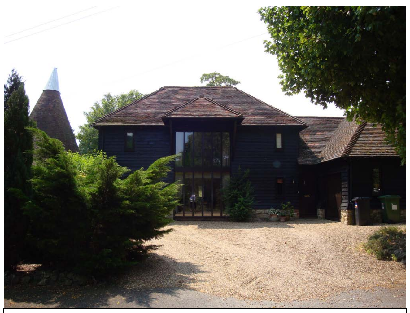
Bell House Barn, converted to a dwelling while maintaining much of its agricultural character.