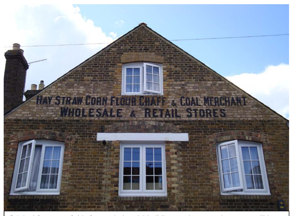
Original features of this former industrial building, such as openings, can still be read on the façade of the Old Corn Store despite the unfortunate installation of plastic windows.