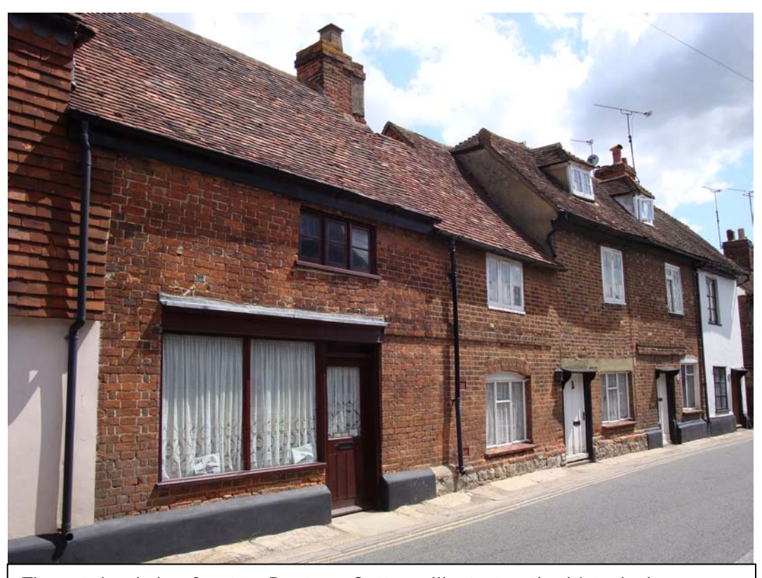
The retained shopfront to Baxter's Cottage illustrates the historical commercial context of The Street.