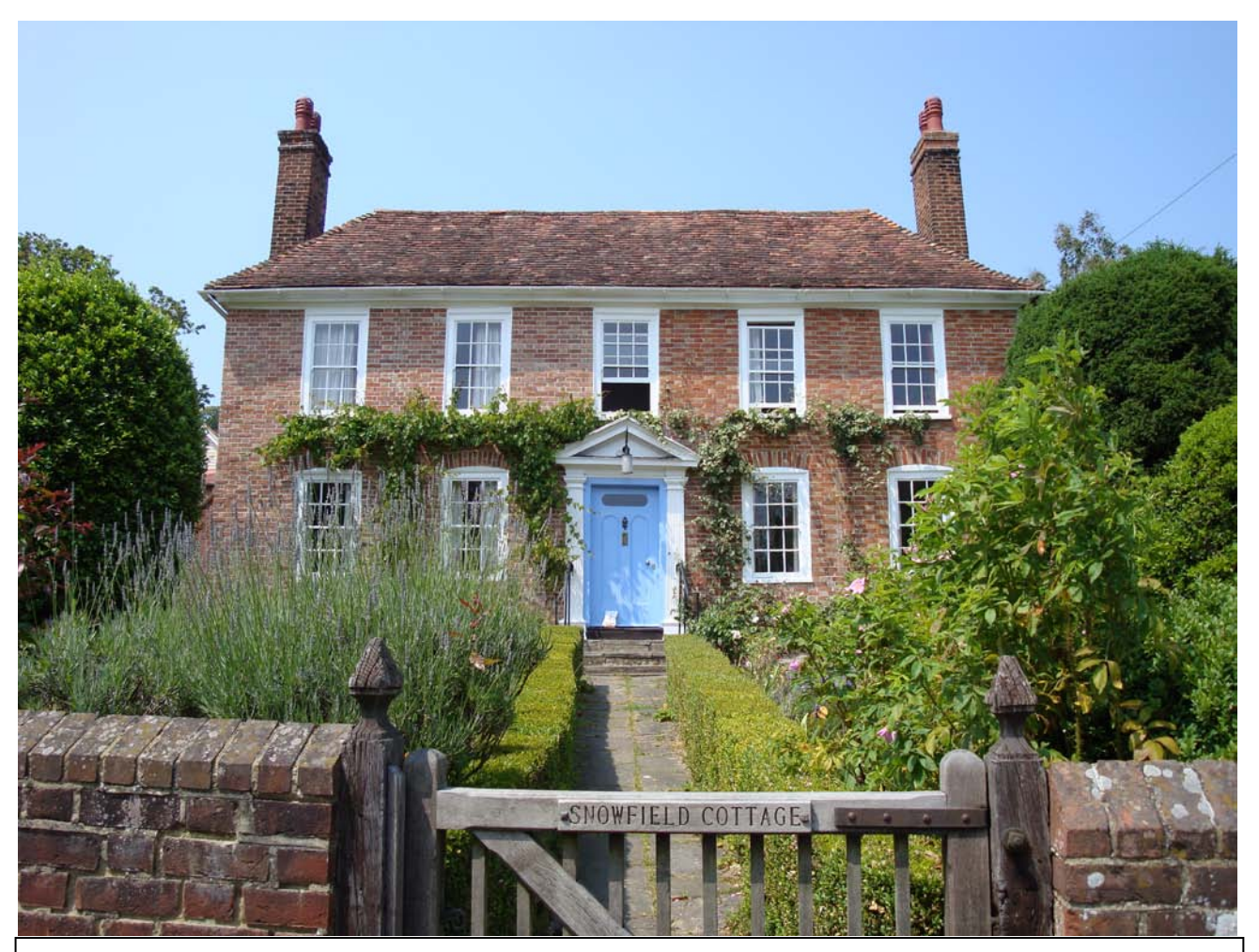
The mathematical tiles on Snowfield Cottage have all the appearance of brick. The regularity of window and door placement is characteristic of 18^{th} century facades.