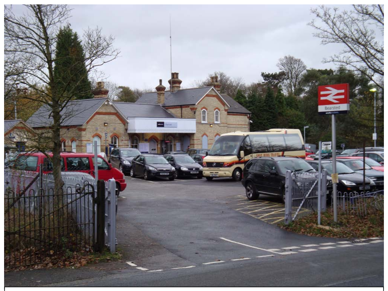
Bearsted railway station includes the well-maintained central building, a passenger shelter on the opposite side of the tracks, and buildings associated with the former coal yard.

A detailed description of all buildings and sites within this suggested extension follows. These descriptions are based on examination from the street and aerial photographs and by historic map analysis. Buildings have not been examined internally or from non-public viewpoints.