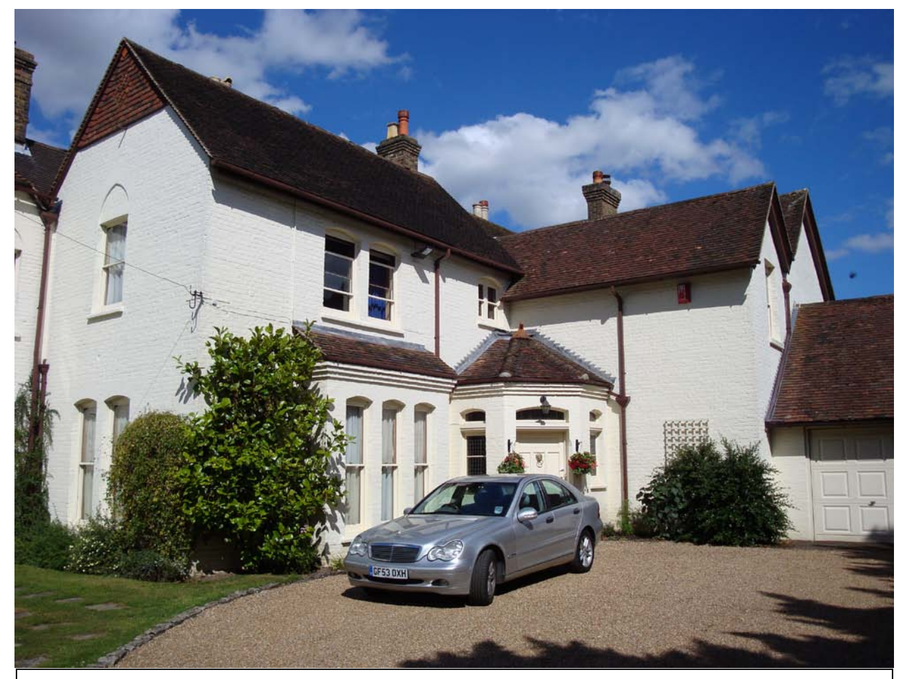
The Old Vicarage. The later Victorian additions are located to the left of this view.

Roughcast facades with applied timber in Swiss cottage aesthetic. Tall red brick ridge stacks and clay tile roof. North Down retains its finials. Timber-framed casement windows and double height bays. Boundary of informal high hedging.