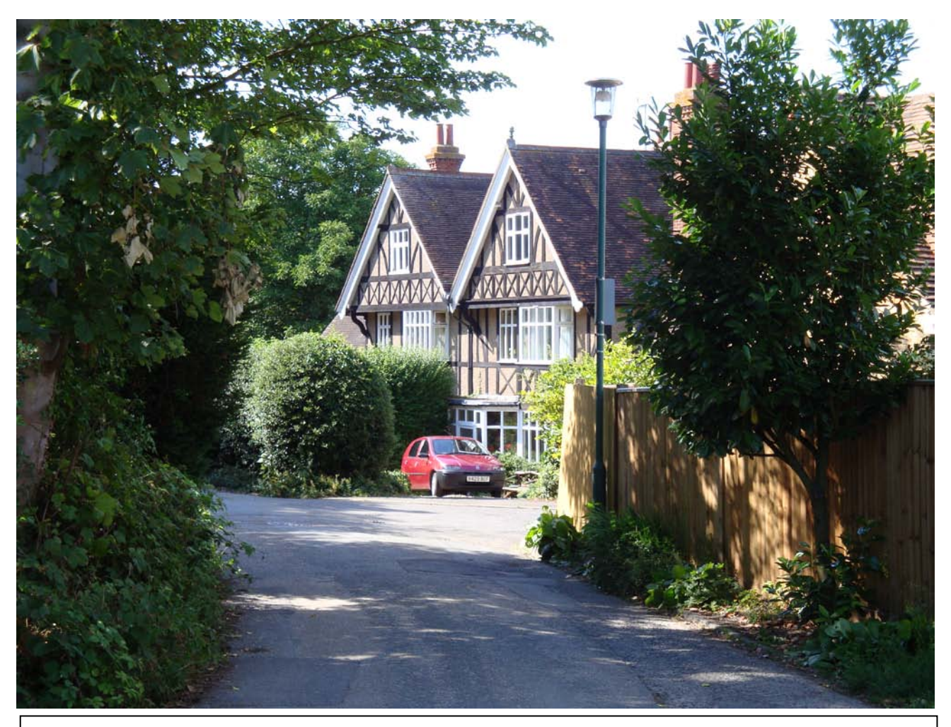
Danedale and North Down, a pair of dwellings located in the northwestern part of Bearsted Holy Cross Conservation Area.

The most westerly section of the Conservation Area, comprising the section of Church Lane which runs north-west to south-east, has a spacious character formed by substantial late Victorian/Edwardian houses which can be broadly described as having elements of the Queen Anne and vernacular revival styles. The mature and substantial planting associated with these houses is a major contributor to the character of the Conservation Area and results in only glimpses of the houses being visible from the road. It also reduces the impact of the modern development in the grounds of Danefield.