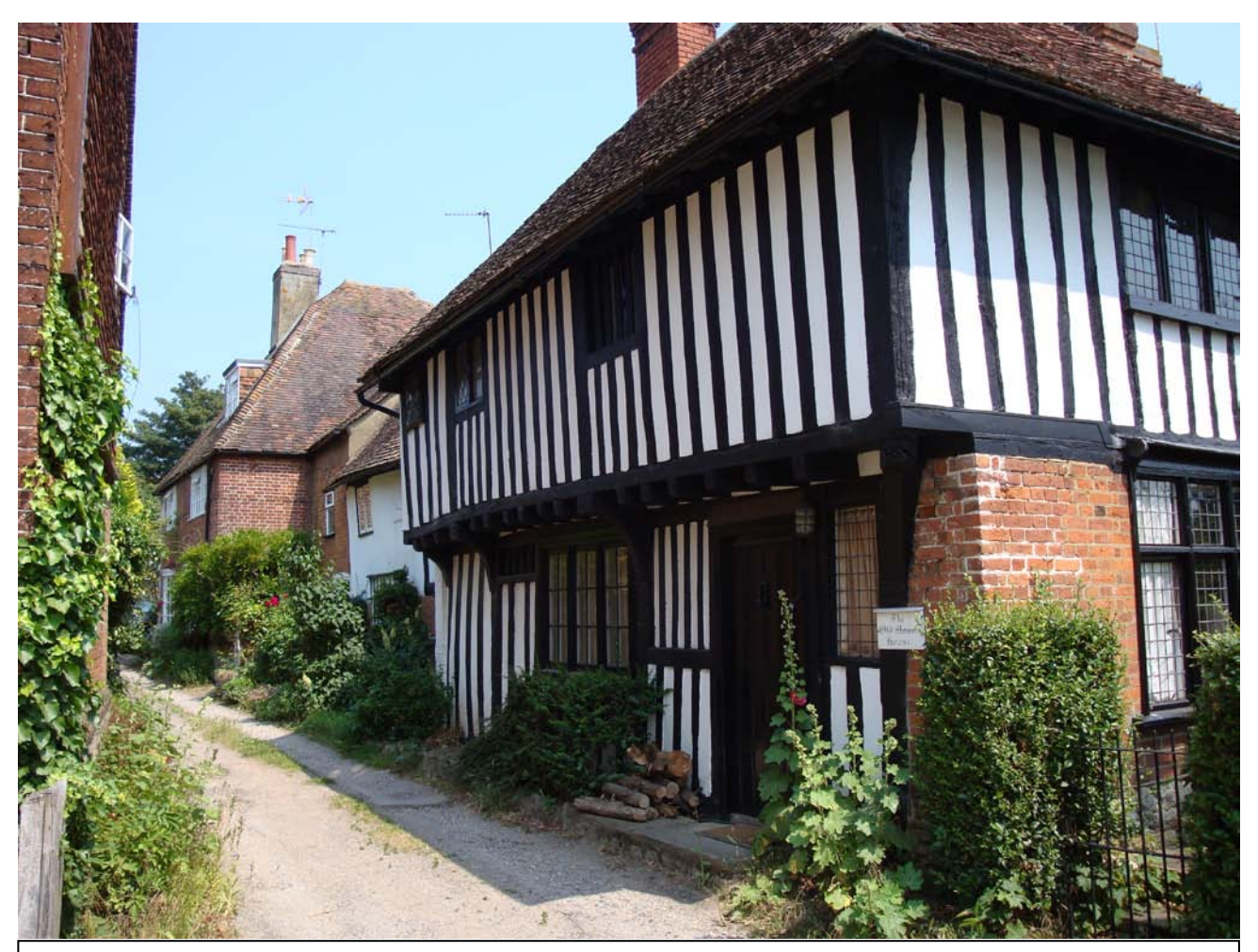
A mix of materials is found throughout the Conservation Area, as in evidence here on Colegate Drive.

Buildings within the Conservation Area are generally small in scale – nothing is taller than two storeys, and single storey buildings are rare. Even the examples of "polite" architecture forming the homes of the gentry are relatively modest in scale. The taller buildings of The Oasts, with their clustered kiln roofs and prominent cowls, provide a single example of a vertical accent.