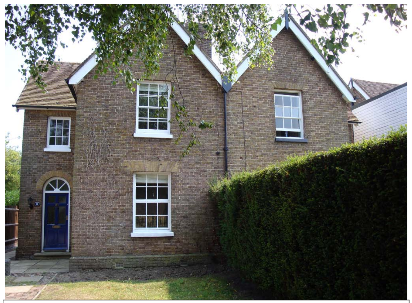
5-6 Mote Hall Villas, the best-preserved pair of this group of six semi-detached dwellings.