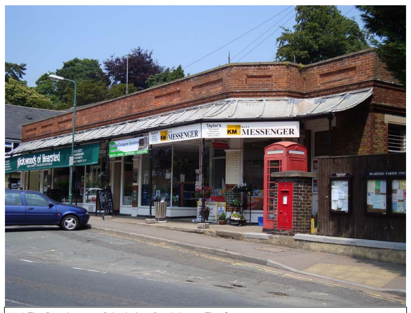
1-4 The Parade, one of the hubs of activity on The Green.