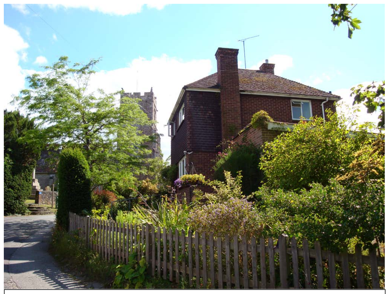
The southern part of the Conservation Area as viewed from the bend in Church Lane.

Vehicles can only progress from here to the car park which lies along the narrow access which passes to the right of the barn. Historically, however, this point is a meeting of routes which are still evident in footpath form – paths go east towards Roseacre, south-west towards the Ashford Road, south towards Otham and east towards Hollingbourne. Mote Hall, the former manor house, lies secluded in the angle of two of these paths, largely hidden behind its outbuildings which front onto them. Other buildings around the church are mainly modest late 19<sup>th</sup> and early 20<sup>th</sup> century houses with a couple of late 20<sup>th</sup> century dwellings interspersed. The fine collection of tombs and tombstones, many dating from the 18<sup>th</sup> and early 19<sup>th</sup> centuries, found within the churchyard, particularly in its south-western corner, are important features of the setting of the church and of the character of the Conservation Area.