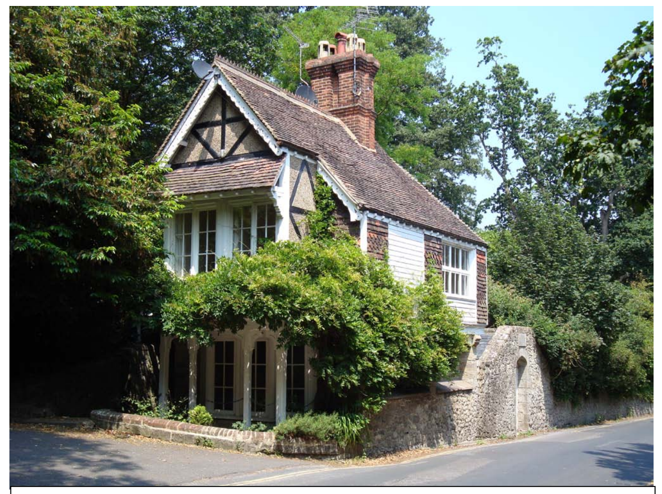
The attractive lodge to Snowfield on Yeoman Lane.