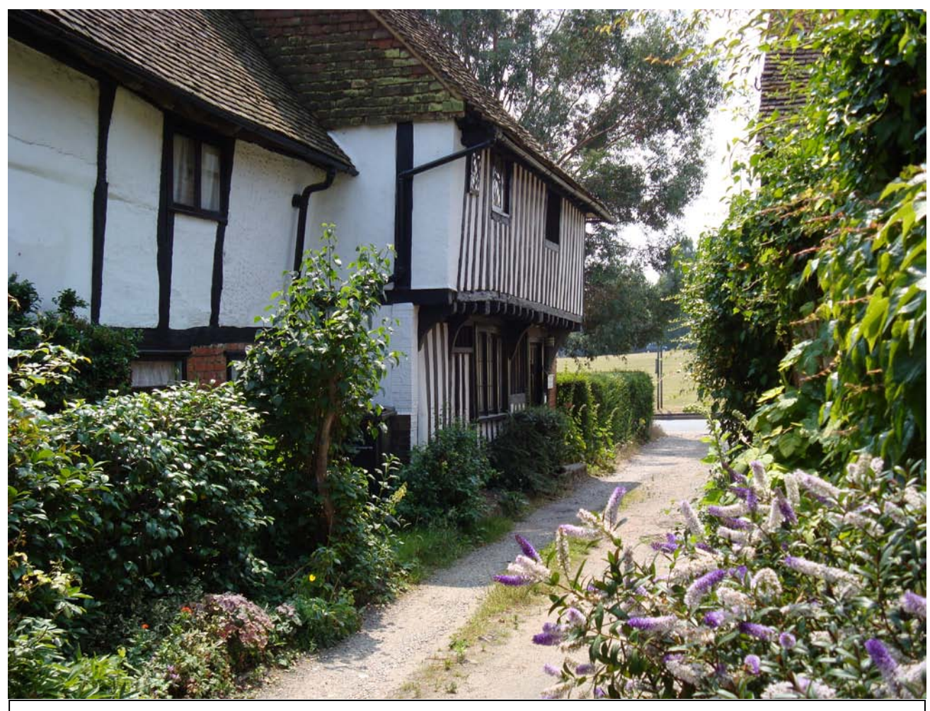
Grade II listed Old Manor House, as viewed from Colegate Drive with The Green in the distance.

Old Manor House, Olde Manor Cottages & Cara Cottages