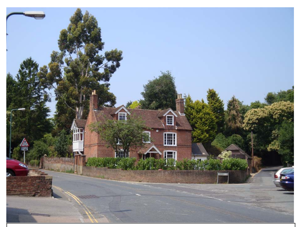
A view of White Lodge, with Ware Street exiting the Conservation Area to the left and Thurnham Lane to the right.

Looking outwards from this same point, the dominant elements in the view are the attractive frontage of the unlisted 18<sup>th</sup> Century White Lodge which occupies a focal position in the sharp angle of the junction of Ware Street and Thurnham Lane and the substantial group of trees in the grounds of Hill House behind it. Beyond this, the road begins to rise between walls and trees and the more open frontage, defined by metal railings, of the railway station becomes apparent to the right as the hill is climbed; there is a feeling of leaving the village.