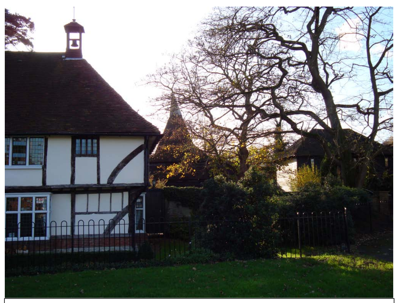
The roots of Bearsted Conservation Area's agricultural past in evidence at the former Bell farmstead, now Bell House, Bell Oast, and Bell House Barn

Behind the ribbon of development along The Street and the more scattered buildings around the Green, open fields remained until the latter half of the 20<sup>th</sup> century; the former agricultural setting is shown to this day by the survival of The Oasts to the south-east of the Green and the former oast and barn to Bell House, all now converted to residential use. Now only the northern side of the village exhibits anything like this sharp interface between built development and open countryside; this has been helped by the presence of the railway line which has acted as a convenient barrier. The fact that the rural setting has been lost or diluted elsewhere makes it even more important that this open land to the north be preserved.