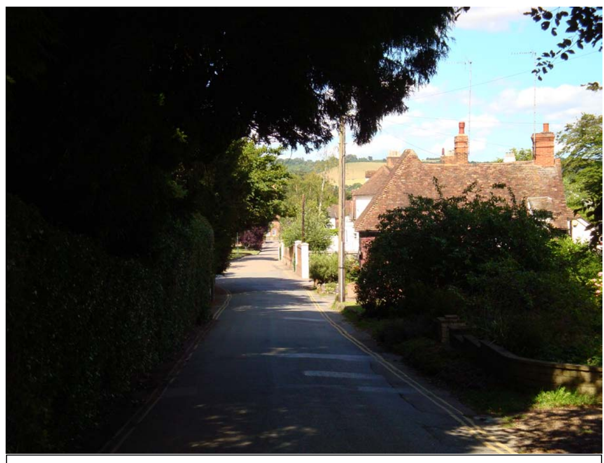
A view into Bearsted Conservation Area from Church Lane.