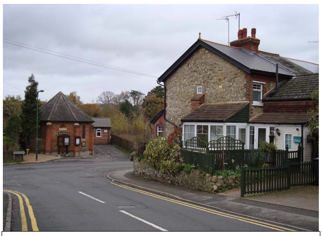
Bearsted Methodist Church and 21 Ware Street viewed from Hog Hill.