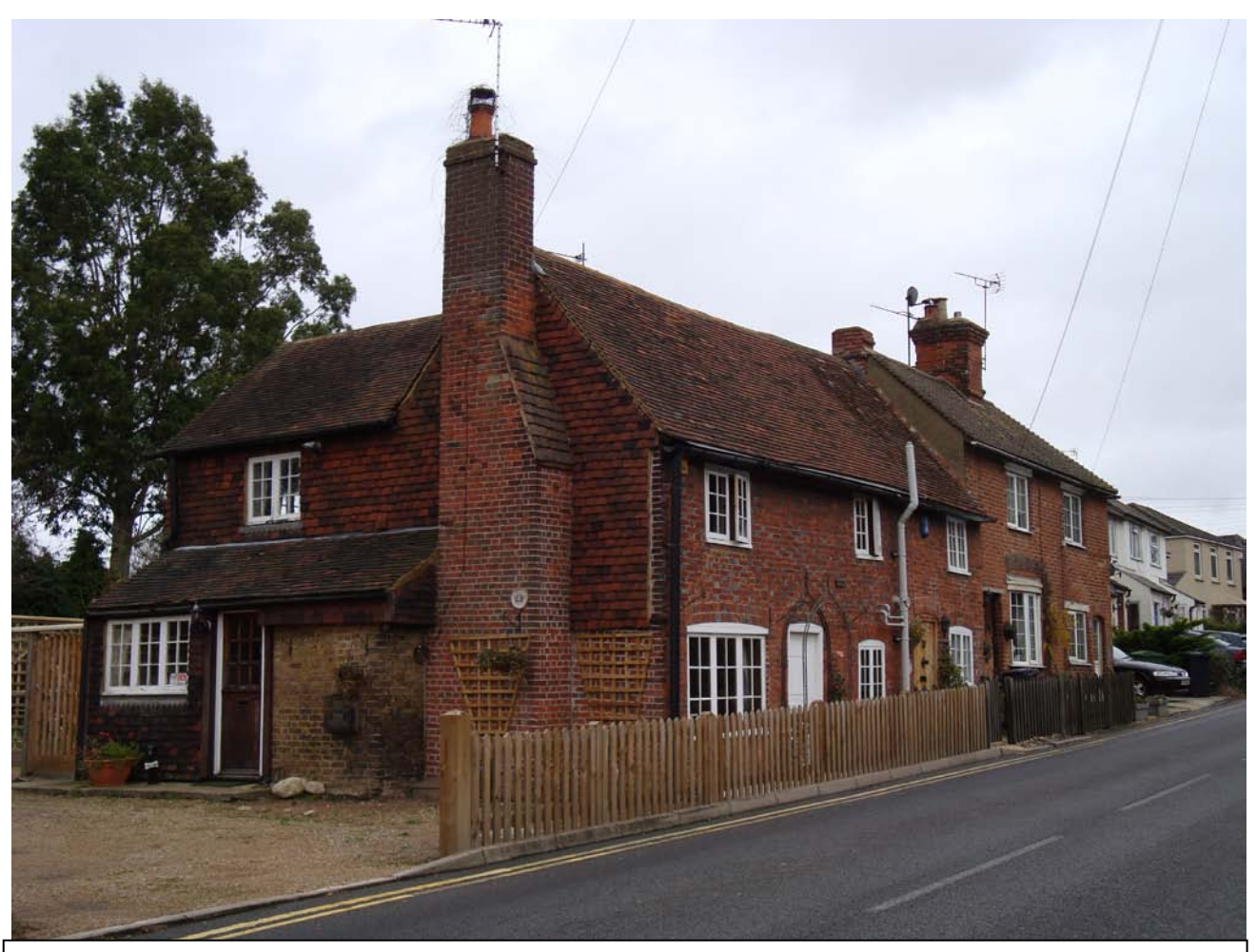
22-28 Ware Street. The listed part of this terrace (Rose Cottages) is in the foreground.