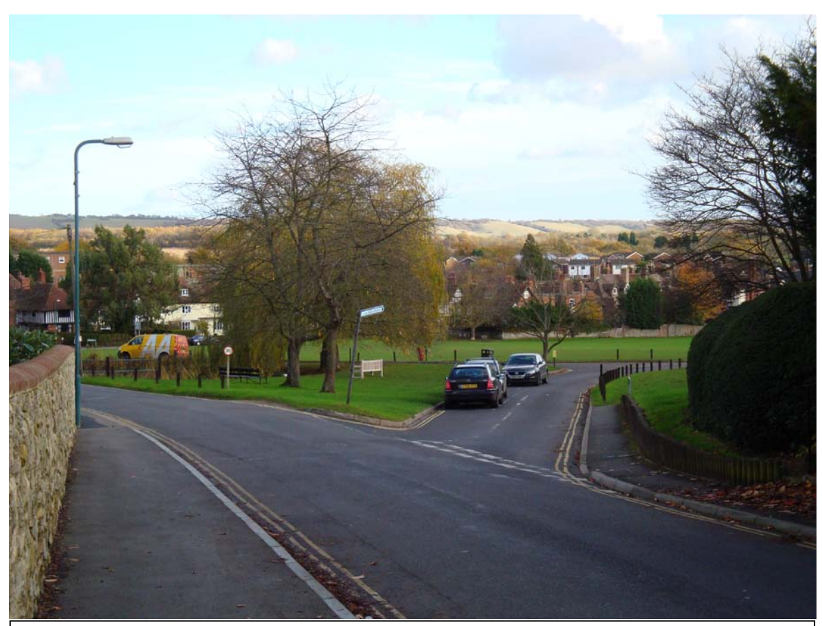
This view of The Green from Yeoman Lane takes in the North Downs, an important part of Bearsted Conservation Area's setting.