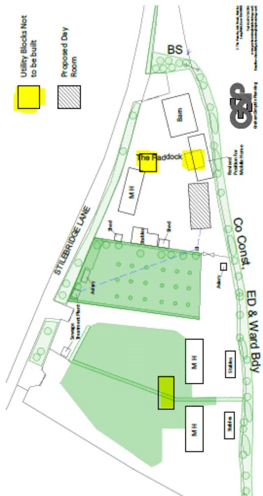
Fig 3: Extract from Layout proposed as part of the current application

3.03 As part of the proposal, the applicant has signed a Unilateral Obligation which gives up the right to build the three utility blocks (total floor area of about 136m 2 ) that have the benefit of extant planning permission. The location of these three blocks are highlighted on the above plan