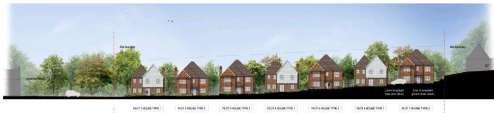
Layout drawing for previously refused application (16/506899/FULL)