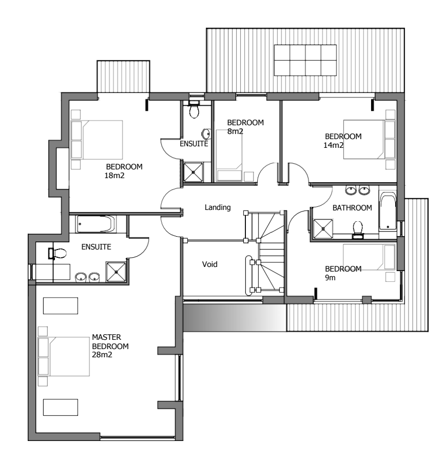
FIRST FLOOR PLAN 115m2