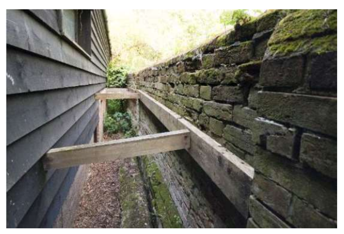
Figure 1 South wall curtilage lists showing existing propping

6.16 The wall that runs mainly parallel to the rear of the studio building demarcated an animal yard from the walled garden and is in three different parts. The middle longer section was built at later date then the other two sections. A number of different parts of the wall have previously been rebuilt and a section lowered in accordance with a permission granted in 1999.