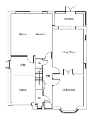
Layout Following Orangery Extension and garage alterations

2.03 Further alterations have since been carried out to relocate the downstairs WC to within the former garage space, including the insertion of a small window: