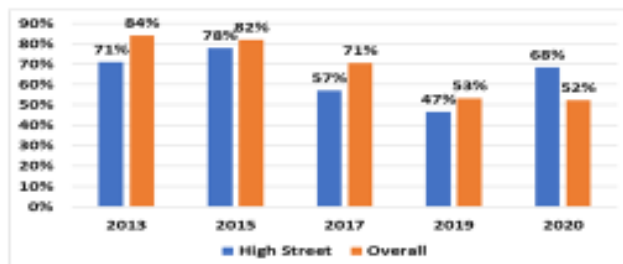
Satisfaction with local area as a place to live