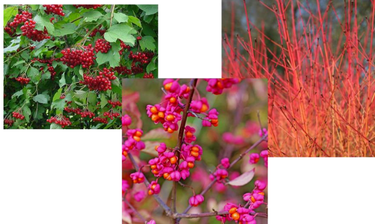
Image 5: Example of plants to be infilled between the dogwood and hawthorn at the back of the site.