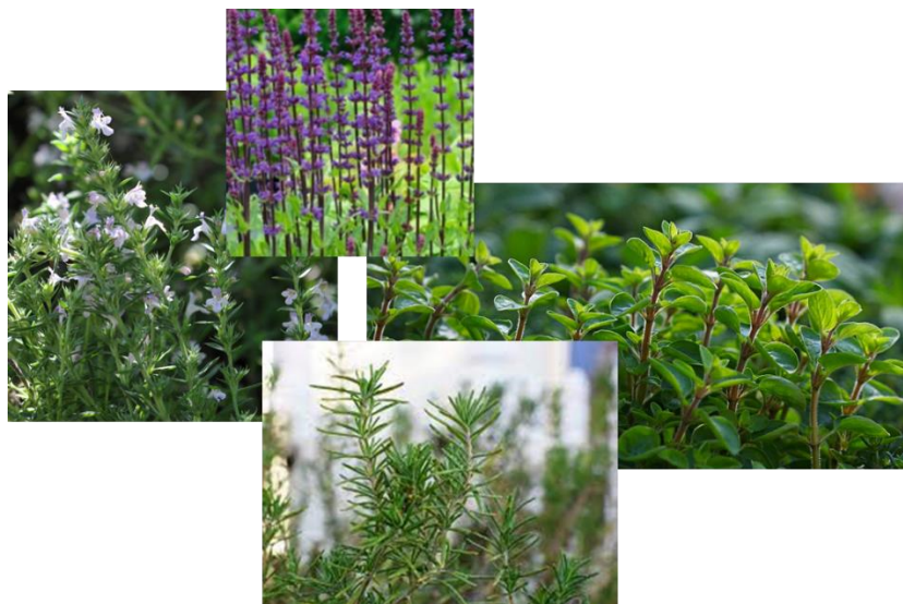
Image 4: Example of plants to be incorporated into Aromatic Nectar-rich Area

2.6 The aromatic nectar-rich area is sited on the area backed by the stone gabions. Potentially the gabions could, with additional work create good habitat too, example shown in Image 2. This will include plants such as Winter Savoury, Rosemary, Marjoram and Wood Sage