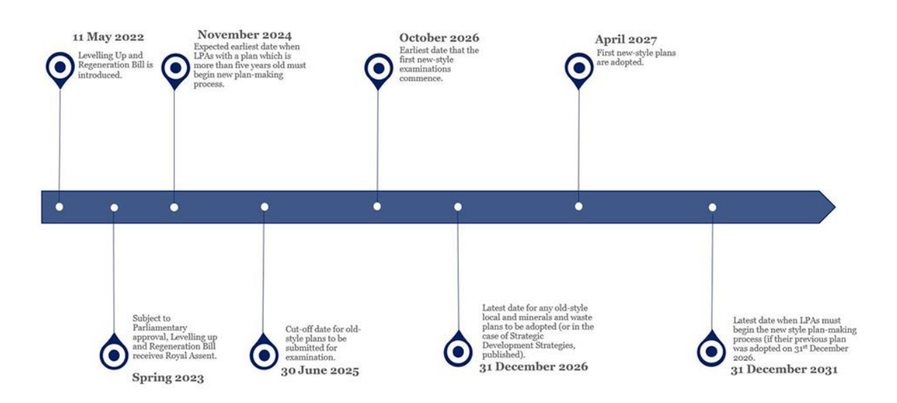
Figure 1. Proposed timetable for plan making changes