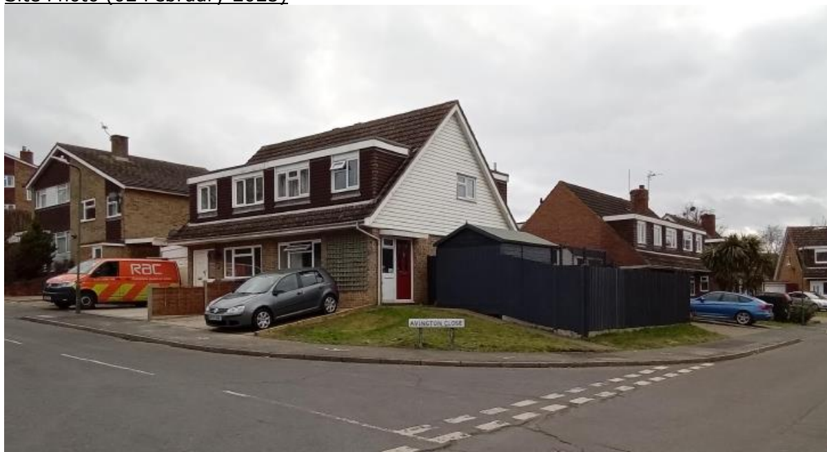
Site Photo (02 February 2023)

20/504423/FULL Erection of a front porch and two storey side extension, including extensions to front and rear dormers. Approved 19.11.2020 (not implemented but extant until 19.11. 2023)