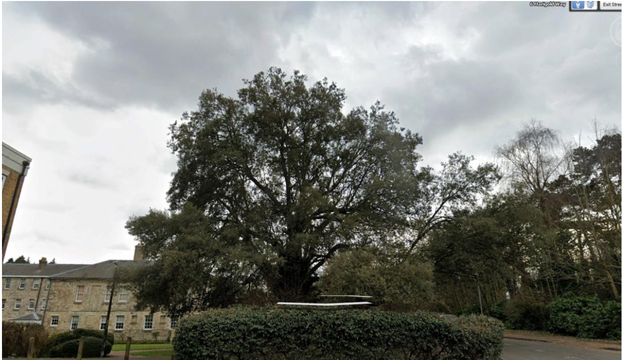
Photo 1 – View from College Practice and Holm Oak tree subject to the application.