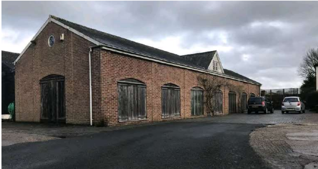
Figure 2: Existing front building elevation