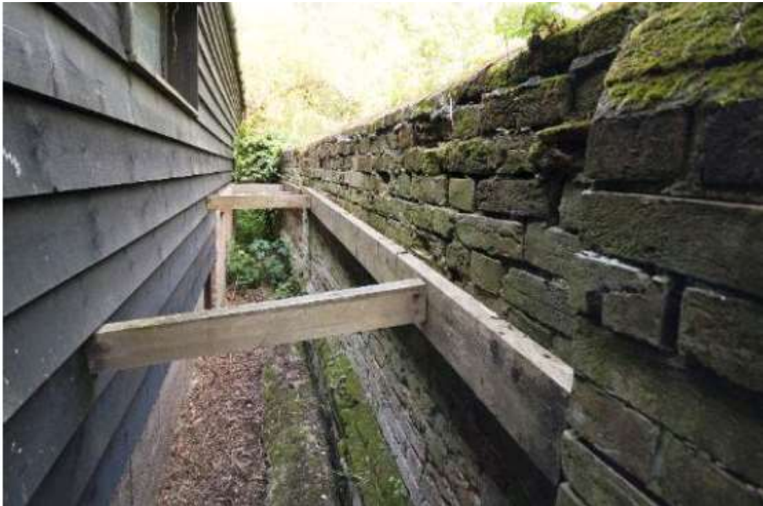
Figure 10 South wall curtilage lists showing existing propping