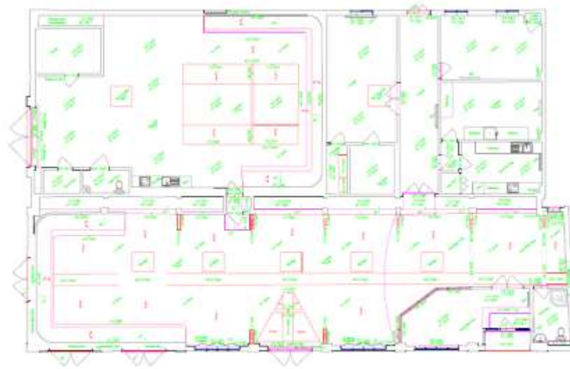
Figure 5 existing ground floor plan (top) and proposed ground floor plan (bottom) showing a reduced footprint in the rear section and new walls in orange.