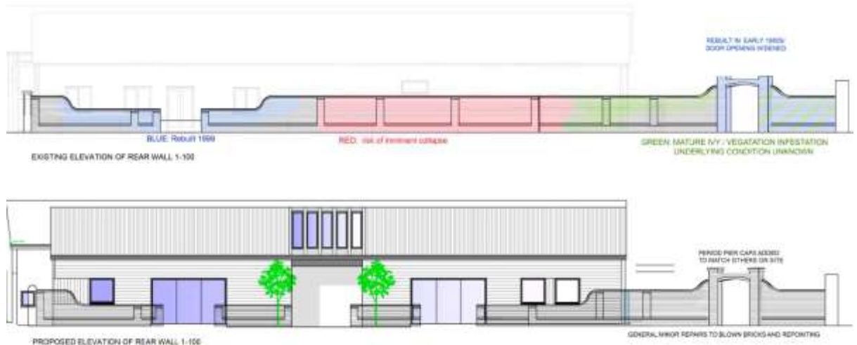
Figure 11 Works to the wall at the rear of the studio building

6.147 It is concluded that the current application building has a neutral impact on the setting of the curtilage listed walls and the glasshouses and the impact of the proposal on the significance of these heritage assets will be less than substantial.