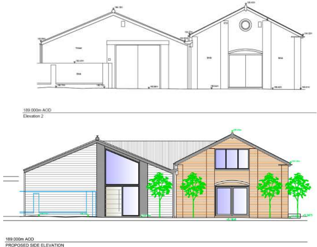
Figure 9: Comparison between the existing and proposed side elevation