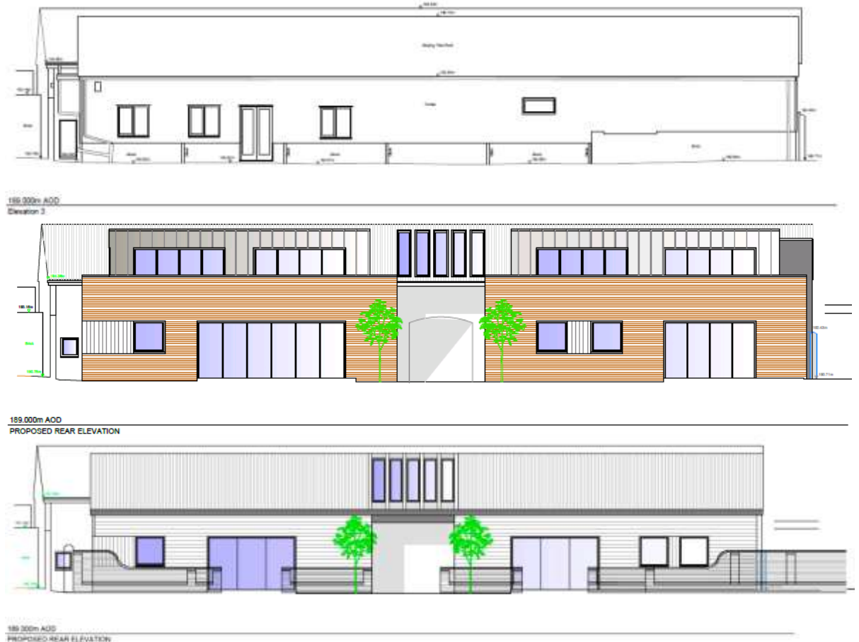
Figure 14: Comparison between the existing rear elevation, the earlier refused application (18/500228/FULL) and the rear elevation currently proposed.

6.220 In conclusion the submitted proposal is acceptable in relation to ecology and biodiversity and is in accordance with Local Plan policy DM1 and DM3.