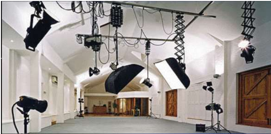
Figure 7 The studio space with blocked up openings visible (right hand side)

pole barn that involved infilling of three open sides was also not a conversion. In other circumstances the judgment advised that the assessment as to whether development was a conversion, or a new build had to be based on the scale and the nature of the proposed works.