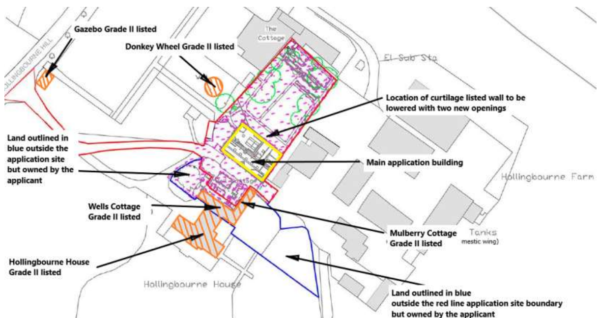
Figure 3: Site outlined in red and adjacent heritage assets