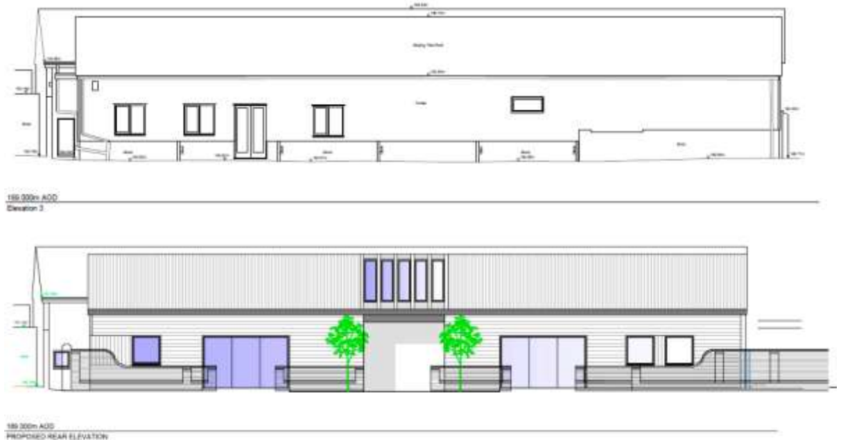
Figure 6: Comparison between the existing rear elevation and the rear elevation currently proposed.