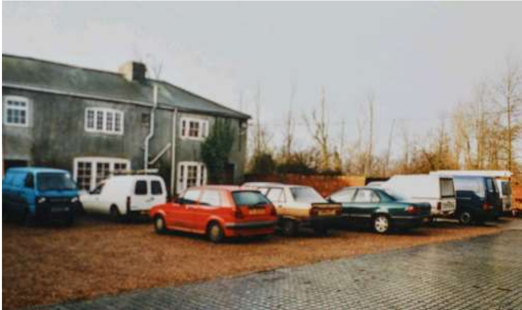
Figure 7: View looking west to Wells Cottage before and after improvement works