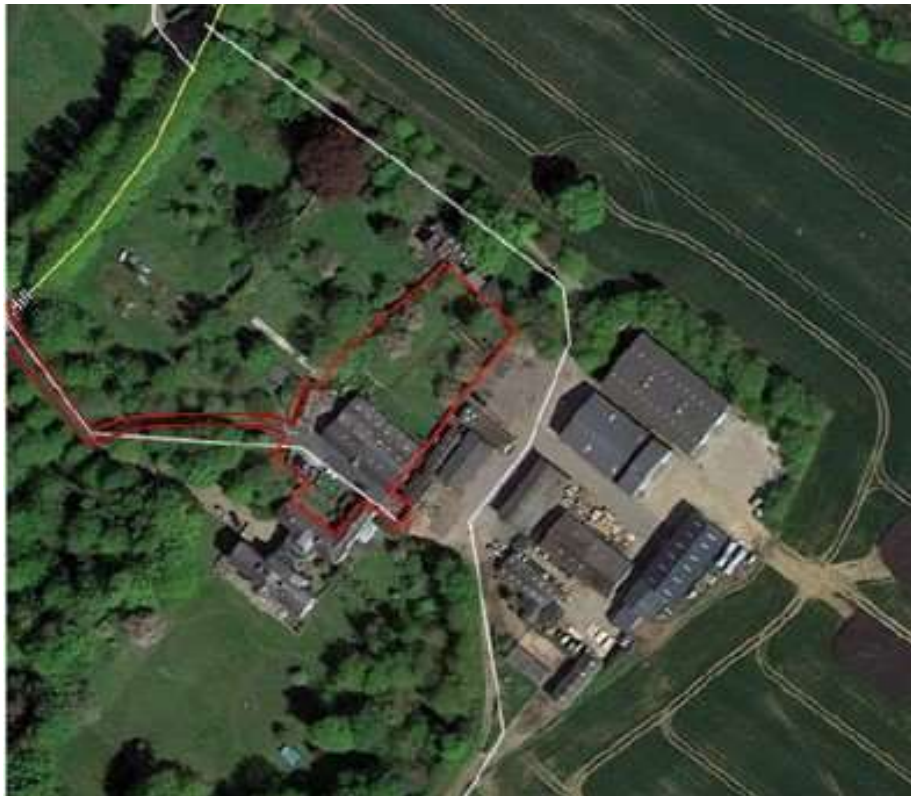
Figure 1: Aerial photograph of the application site