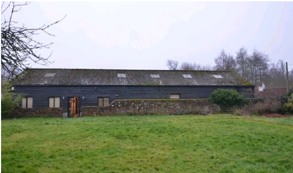
Figure 8 Rear elevation of the building viewed from the rear walled garden