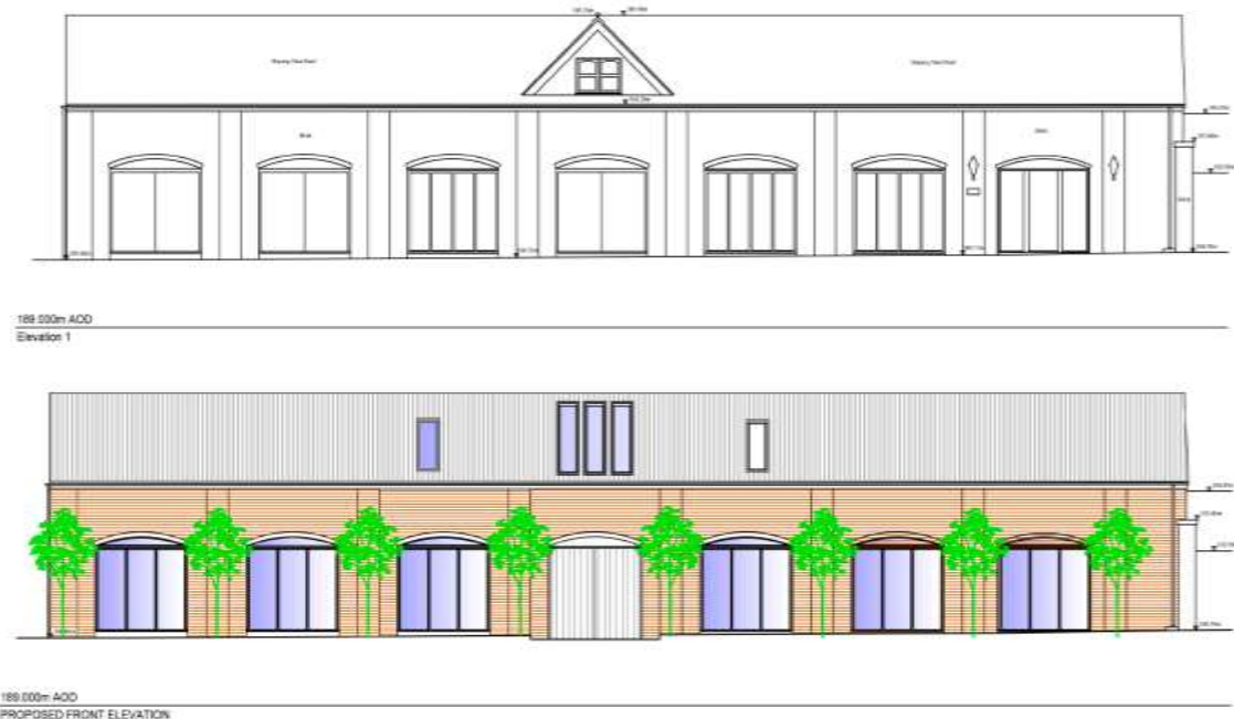
Figure 8: Comparison between the existing and the proposed front elevations