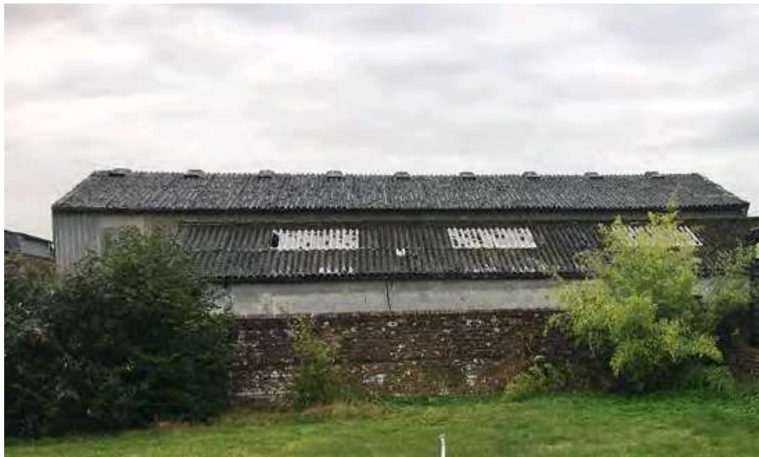
Figure 4 Garden view to the south east towards neighbouring agricultural buildings