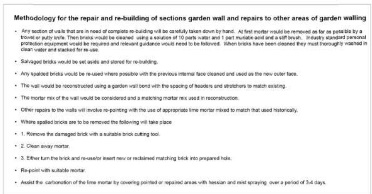
Figure 12: Methodology for repair and rebuilding the garden walls