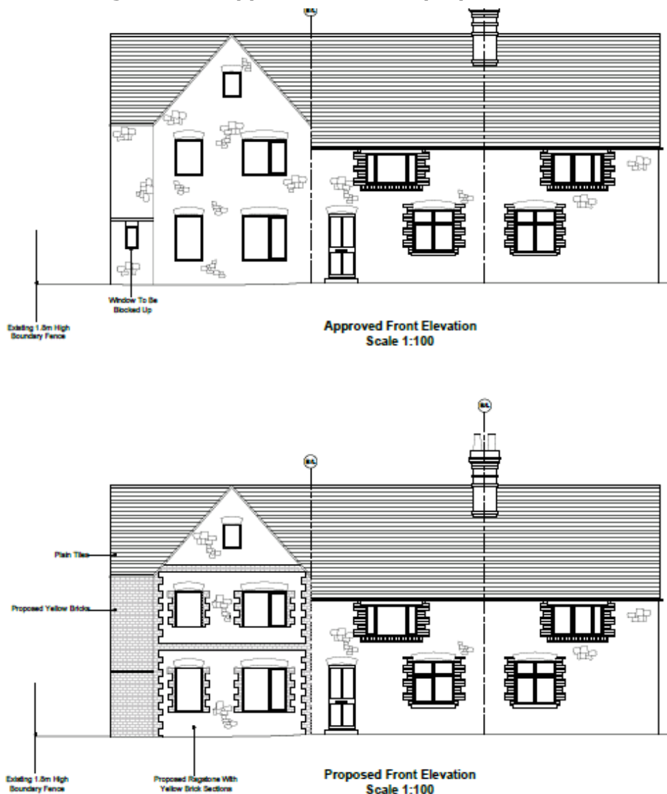
Figure 1. As approved and now proposed front elevation