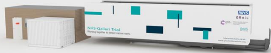
Visual representation of the facility rear.