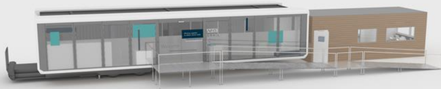
Visual representation of the facility front.