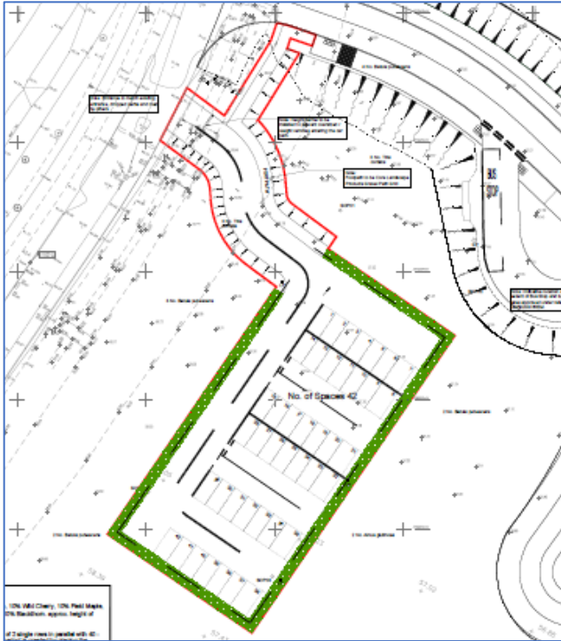
Current proposal- 22/502289/REM

For clarity, Members are advised that the following shows the differences between the scheme approved under 20/502037/REM and the current proposal. The current proposal has a red line that is much more limited in regard of its frontage to the 2 roads adjacent.