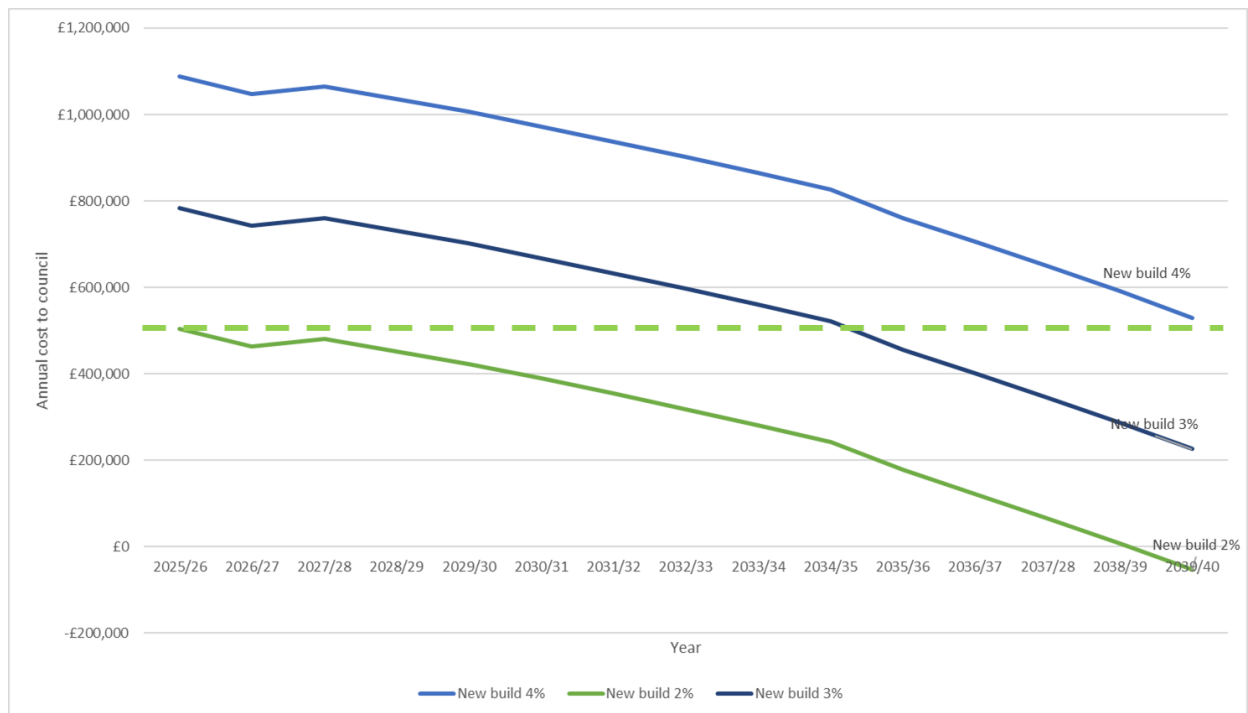
Graph 2 showing interest rate comparisons for a new-build leisure centre