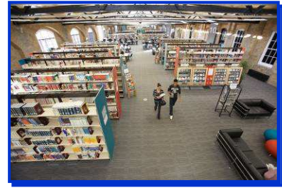
Drill Hall Library – at 184meters is the longest in Europe.