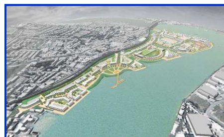
Drawing of proposed development. 2