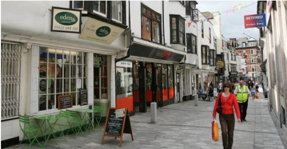
View of the completed scheme in Bank Street