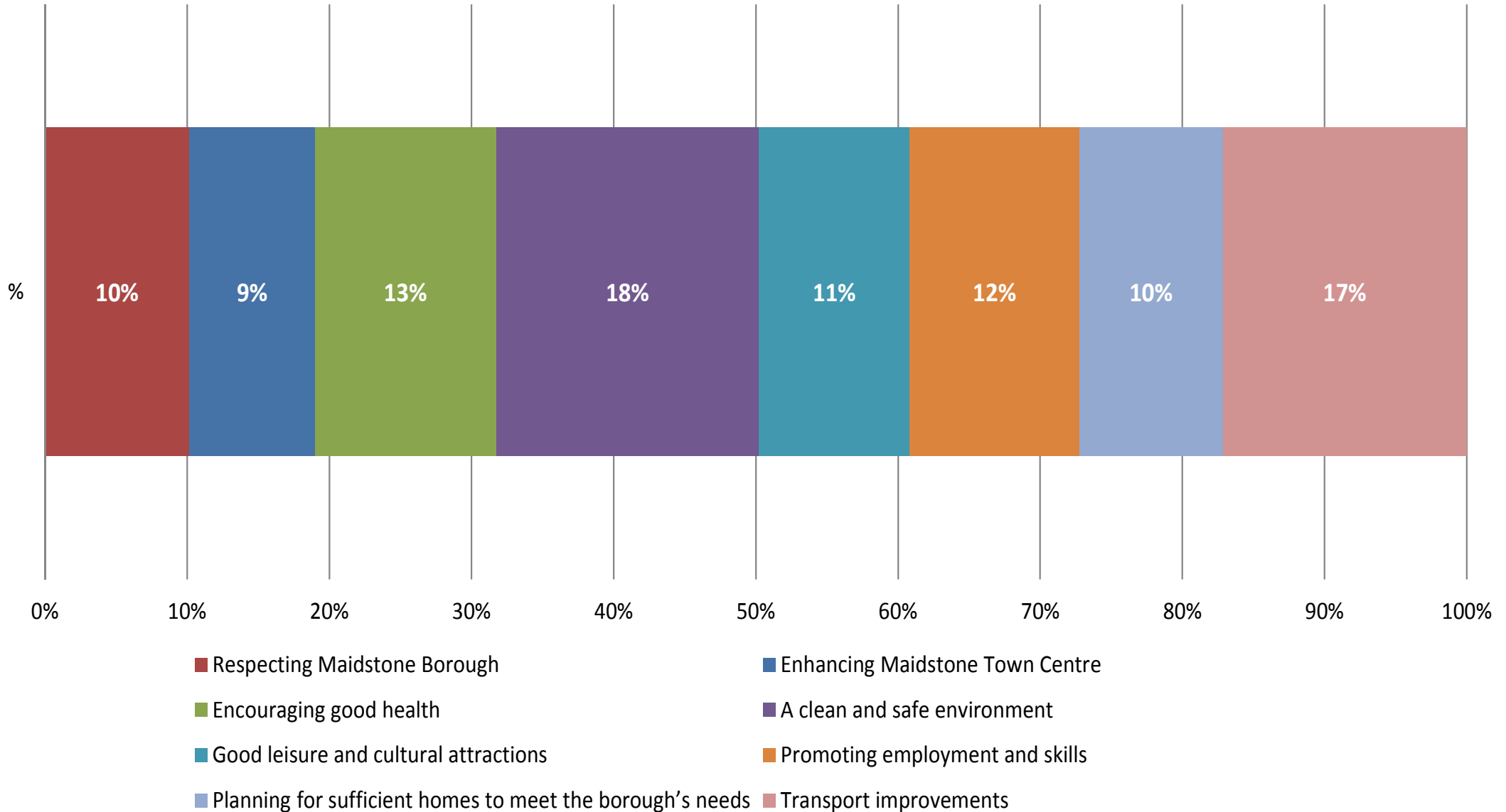
Percentage of responses by priority