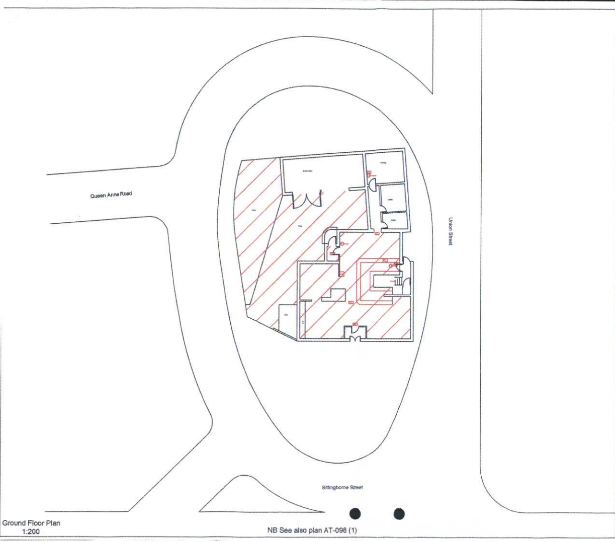
Ground Floor Plan 1:200